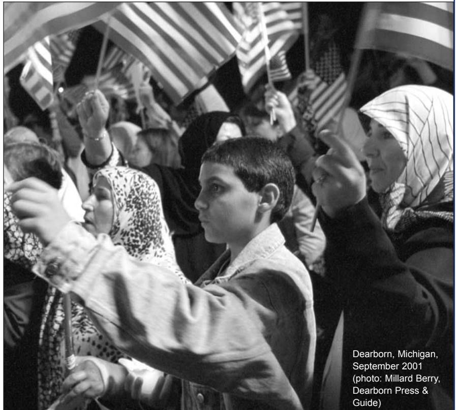
Dearborn, Michigan, September 2001

"Because men with hard faces do violent things, because fanaticism seizes and shrinks minds, is no reason for the rest of us to abandon our songs. Maybe we need to sing louder."